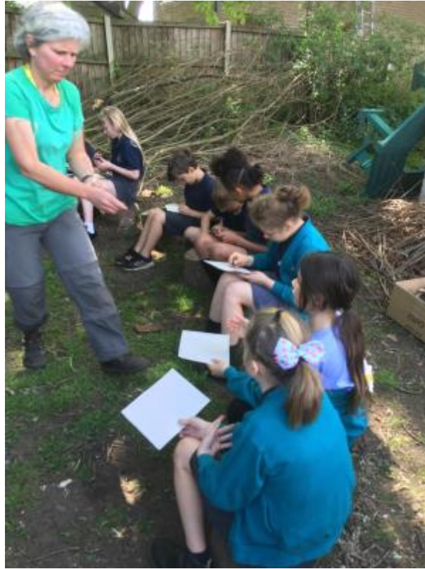
3 - Year 4 being creative with charcoal!

Please can we remind parents & carers that we would appreciate no ball games being played on the playground before and after school. This is to ensure no one is hit by a flying ball when they are dropping children off or picking them up. Also, please can we remind that bikes and scooters should be walked in the playground and not rode. Thank you.