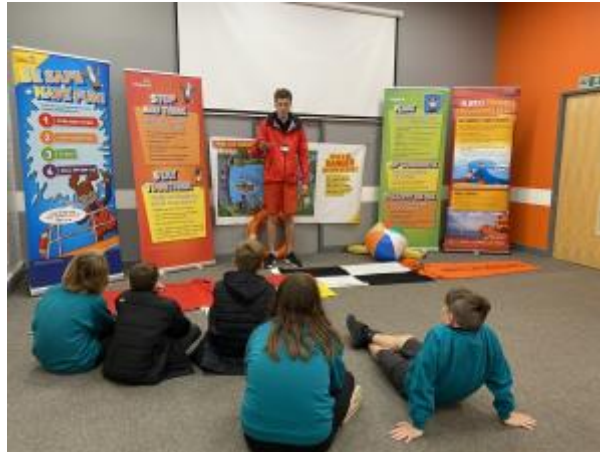
1 - Year 6 had an enjoyable afternoon at Crucial Crew.