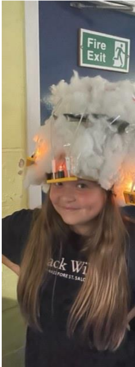
3 - A Christmas hat design to put on your Christmas list!