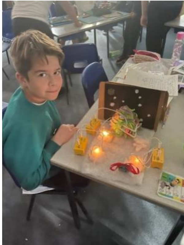
2 - In science, Year 6 had to design a product using an electrical circuit. The product had to be for a celebration. Here's a great Christmas design, ideal for your mantelpiece!