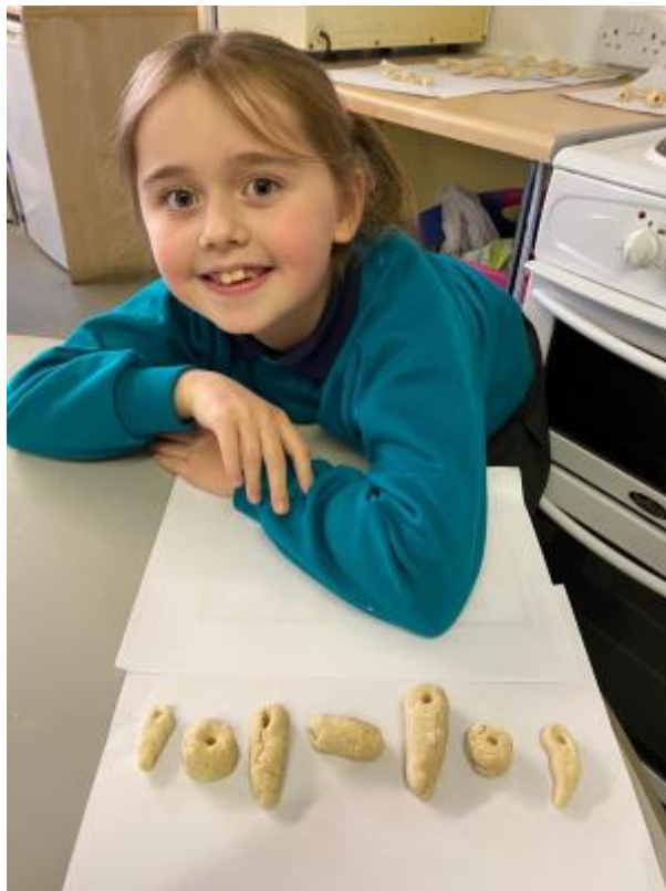
4 - Year 3 were busy making Stone Age jewellery this week!