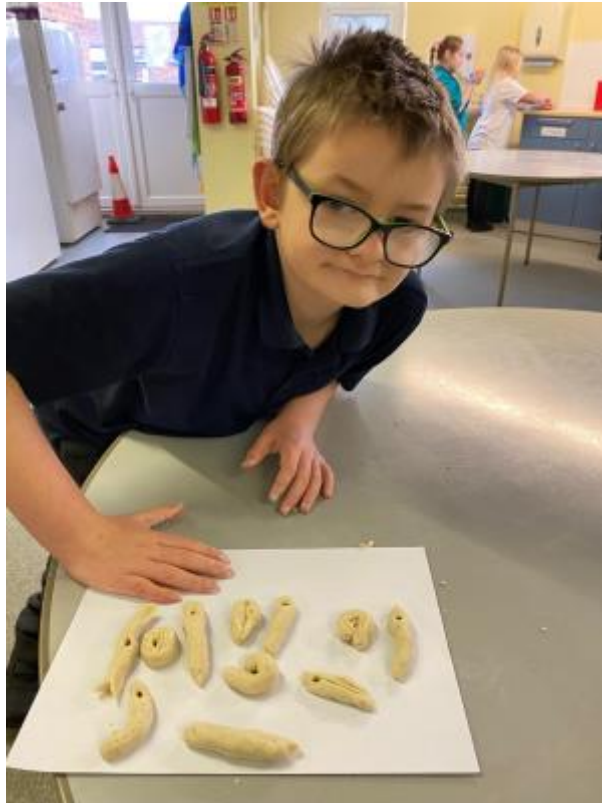
5 - More Stone Age jewellery!