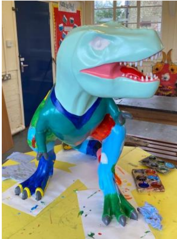
3 - The Go Go Dinosaur is coming along nicely! We look forward to seeing the final design soon.