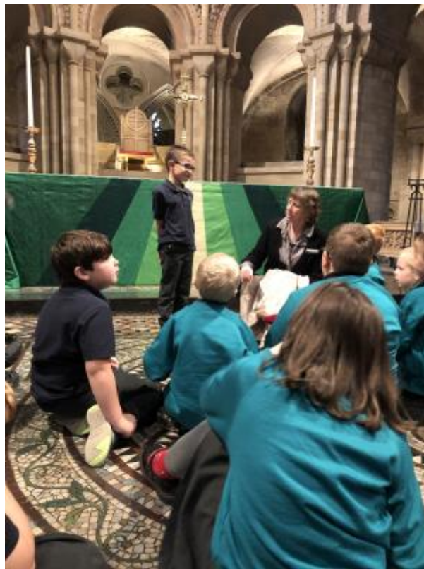
3 - Year 3 enjoyed their trip to the Cathedral