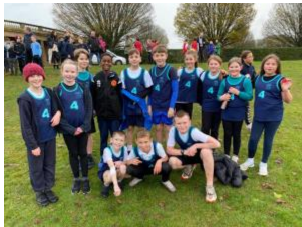
3 - Our brilliant and brave cross country runners this afternoon!

Please see the diary dates for a reminder of when they are happening.