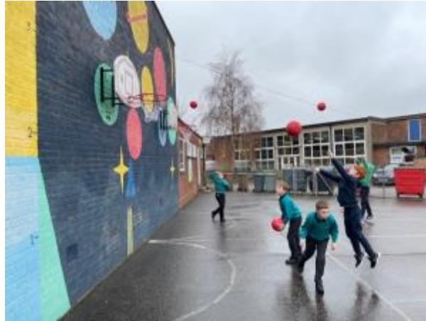
2 - The children were enjoying the new basketball hoops at lunchtime today!