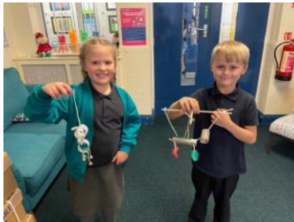
4 - 4I have been making impressive puppets today in design and technology.

We have been noticing a lot of chocolate bars for snack and in lunch boxes. Please can we remind all parents and carers that we do not allow chocolate bars such as 'Mars' and 'Dairy Milk' in school. We do allow chocolate biscuit or wafer bars for a snack or for lunch. We also do not allow 'sweets' for snack or packed lunches. Thank you for your support.